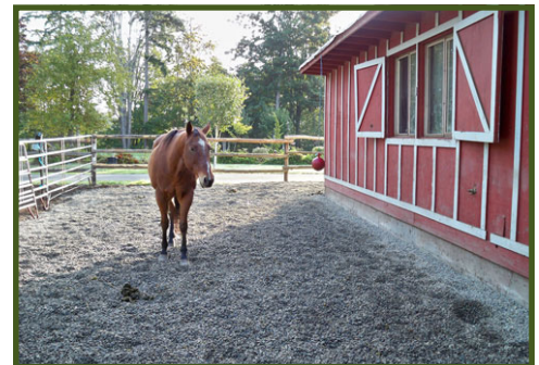
Heavy Use Protection Area Best Management Practice After Implementation