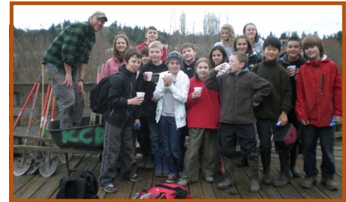
Volunteers from Kirkland Environmental and Adventure School at Totem Lake