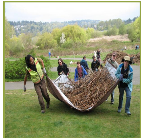
Volunteers working at Juanita Bay Park as part of the Green Kirkland Partnership Program