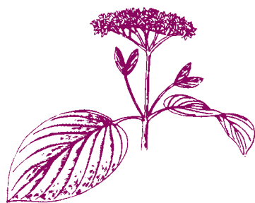
Red Osier Dogwood