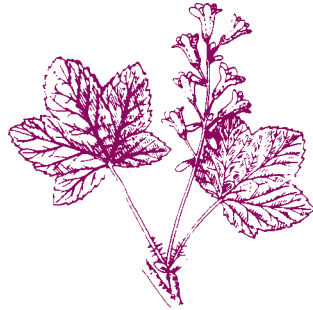
Red Flowering Currant