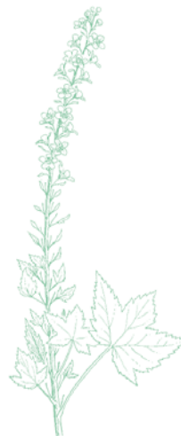
Stink Current ( Ribes Brateosum )

The poster is not available by mail through the King Conservation District. The boundary of the District includes most of King County, excluding the incorporated cities of Enumclaw, Federal Way, Milton, Pacific and Skykomish. The poster can be purchased and mailed to an address of your choice by visiting the Good Nature Publishing Company at www.goodnaturepublishing.com .