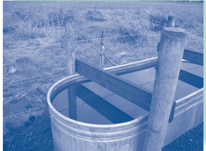
Livestock watering facility installed on a beef operation in King County under EQIP: Off-site watering troughs protects streams and ditches from contamination by providing alternative access for livestock to water as well as enhancing vegetative cover by proper distribution of grazing animals.

For more information on the EQIP or any other Farm Bill Programs or to submit an application for next years funding cycle, contact Clare Flanagan, Resource Conservationist, USDA NRCS, 935 Powell Ave, Suite C, Renton, WA 98057 at (425) 277 5580 ext 124. clare.flanagan@wa.usda.gov .