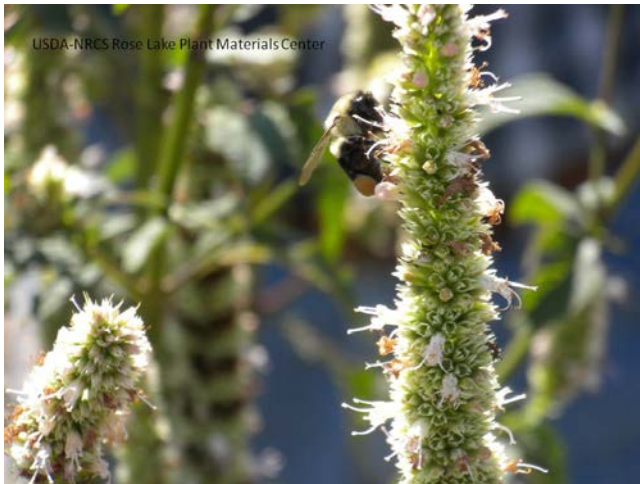
Common Eastern bumble bee ( Bombus impatiens ) on giant yellow hyssop ( Agatache nepetoides ).

This technical note provides information on how to plan for, protect, and create habitat for pollinators in agricultural settings. Pollinators are an integral part of our environment and our agricultural systems; they are important in 35% of global crop production. Animal pollinators include bees, butterflies, moths, wasps, flies, beetles, ants, bats, and hummingbirds. This technical note focuses on native bees, the most important pollinators in temperate North America, but also addresses the habitat needs of butterflies and, to a lesser degree, other beneficial insects.