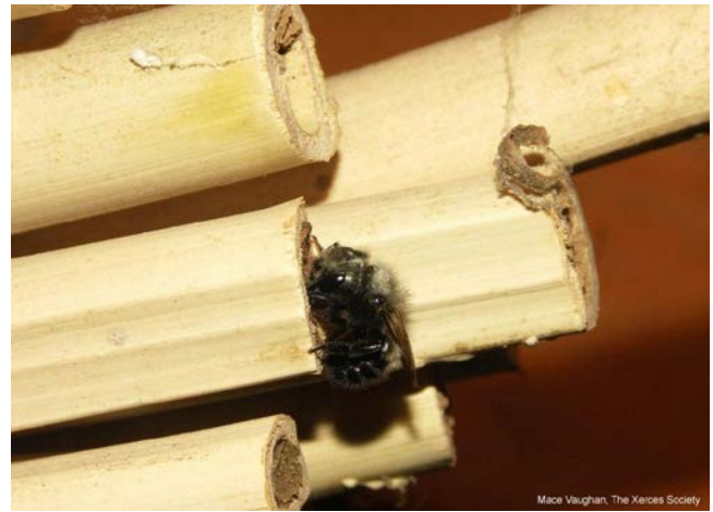
A mason bee closing the entrance to her nest with mud after laying a series eggs in the tube.

MATERIALS: While in most cases native plants are preferred, non-native ones may be suitable for some applications, such as annual cover crops, buffers between crop fields and adjacent native plantings, or short-term low cost insectary plantings that also attract beneficial insects which predate or parasitize crop pests. For more information on suitable non-native plants for pollinators, see Table 4.