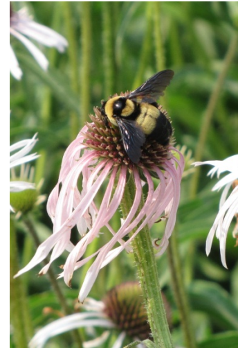
Bumble bee ( Bombus fraternus ) on pale purple coneflower ( Echinacea pallida ).

Keep in mind that small bees may only fly a couple hundred yards, while large bees, such as bumble bees, easily forage a mile or more from their nest. Therefore, taken together, a diversity of flowering crops, wild plants on field margins, and plants up to a half mile away on adjacent land can provide the sequentially blooming supply of flowers necessary to support a resident population of pollinators.