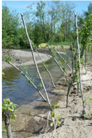
Taken from Guidelines for Bank Stabilization Projects in the Riverine Environments of King County. KCSWM, 1993.