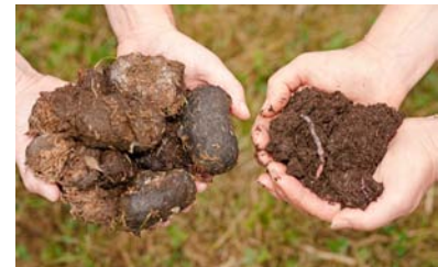
Raw manure and finished compost

Piles should be kept between 130°F and 185°F for three to four days to destroy weed seeds, fly larvae and plant pathogens.