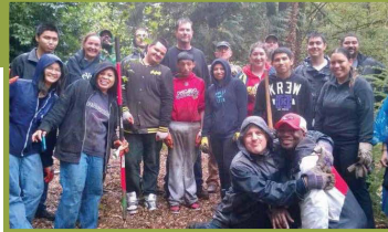
Starbucks employees and friends goof around after a wet work party at Lake Fenwick Park