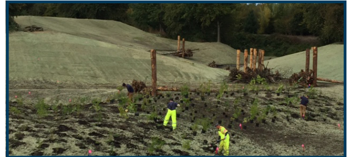
Leber Homestead Project - Mill Creek Side Channel Creation