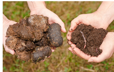
Raw manure and finished compost

Compost can be applied to pastures, lawn, landscapes and garden beds. A general guideline for applying compost to pastures is a half-inch per application and no more than two to three inches per year. Compost should only be applied during the growing seasons in the spring, early summer and fall.