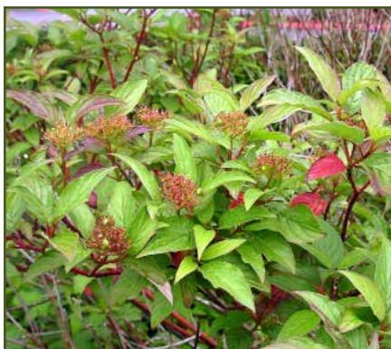
Red Osier Dogwood

Check website for information on local chapter plant sales. 888-288-8022/206-527-3210 wnps.org