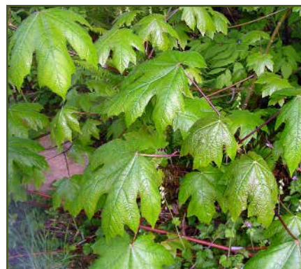
Big Leaf Maple