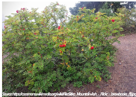
Sitka Mountain Ash